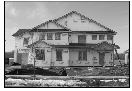
Charleston XXIV Building Trades House