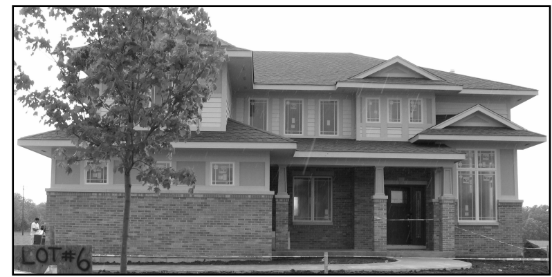
2006-07 Building Trades House – Charleston XXIII

If interested, you can call Kristin Dierking at (630) 377-6200.