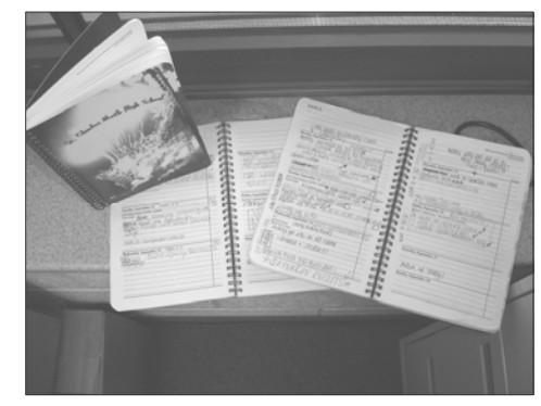
Student Planners are critical to success.

As part of our school improvement process at St. Charles North, we are committed to using our student planner to improve time management, planning, and communication between students, staff, and parents. We believe these skills are critical to our students' academic success not only in high school, but throughout their lifetime. We have asked students to bring their planner to class to record assignments. Please ask your student about the planner, and help us encourage them to use it to keep track of all of their responsibilities!