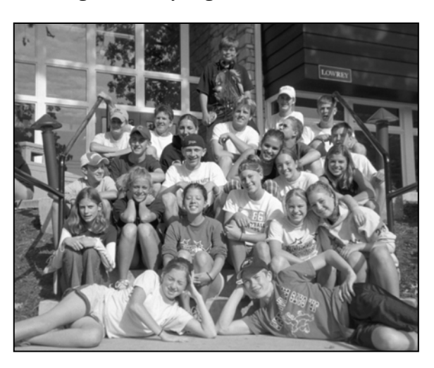
Peer Leadership Camp at Lake Geneva, July 2004

Peer Leadership Groups will be meeting throughout the school year, creating many more relationships, memories and life long skills! Way to go North Star Peer Leadership!