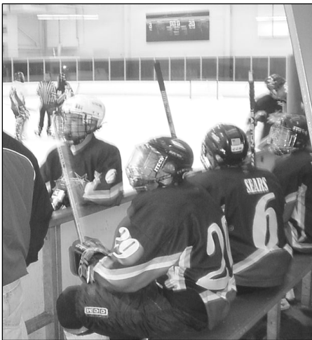
North Hockey Team eager to skate!

The St. Charles North Hockey Club is fielding two teams for the 2004 - 2005 hockey season. The Varsity hockey team plays the majority of their home games on Sunday evenings at the Fox Valley Ice Arena on Kirk Road in Geneva. Admission is free for students, and three dollars for adults. The Junior Varsity team plays most of their home games on Saturdays at the Polar Dome in East Dundee (off Route 25 at Santa's Village). Admission is free.