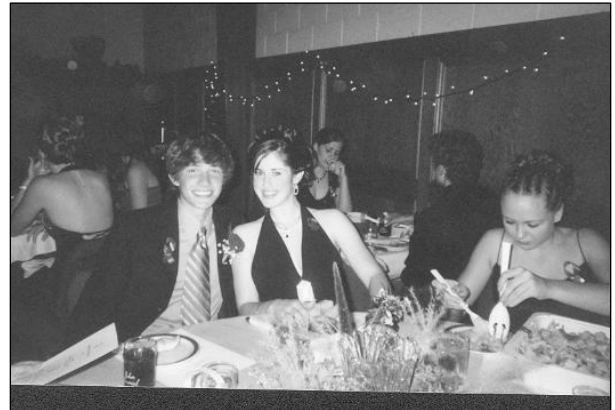
Students enjoyed the Alternative Homecoming Dinner

The St. Charles North High School chapter of the National Honor Society hosted an Alternative Homecoming Dinner this past Saturday evening at Baker Memorial Church, downtown St. Charles. The event was intended to give students the opportunity to attend a dinner prior to the homecoming dance that would provide a service to individuals in Africa that are suffering with AIDS. The cost of the dinner was $20 per person and students enjoyed a full menu of options catered by Olive Garden. Due to the kindness of an anonymous donor and several donations from local vendors, the event raised approximately $3,000 which will be sent to the Fishwabi village in Africa with the help of Worldvision, a local humanitarian organization. Over 100 students were in attendance, with 25 faculty, staff and parents who volunteered to serve the students that evening.