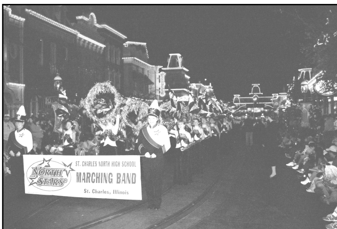
Our North Star banner led off the parade in Disney World, followed by our color guard and marching band.