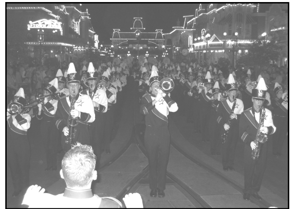
The Marching North Stars represented our high school with pride and precision down Main Street at Disney World.