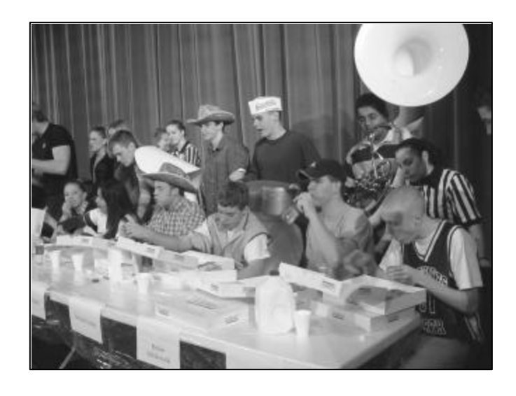
North HS students and staff raised over $3,000 to help local elementaryaged students by participating in the donut -eating contest

A special thanks goes out to all of the students and staff who helped with the event and the parents and community members who donated.