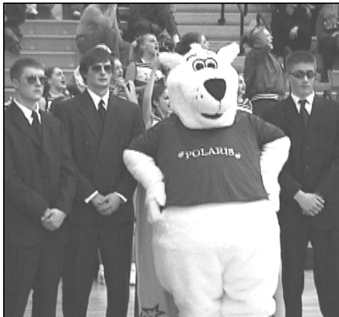
POLARIS, the new St. Charles North High School Mascot

North Star and was the reason it was chosen as a symbolic representation at St. Charles North High School.