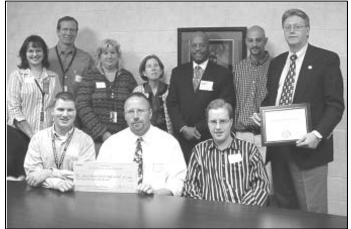
Siemens Award presentation