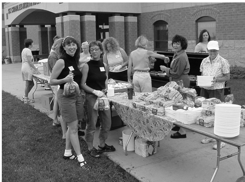
Thank you to our wonderful PTO moms for hosting the Freshman Class Picnic held in August, 2001.